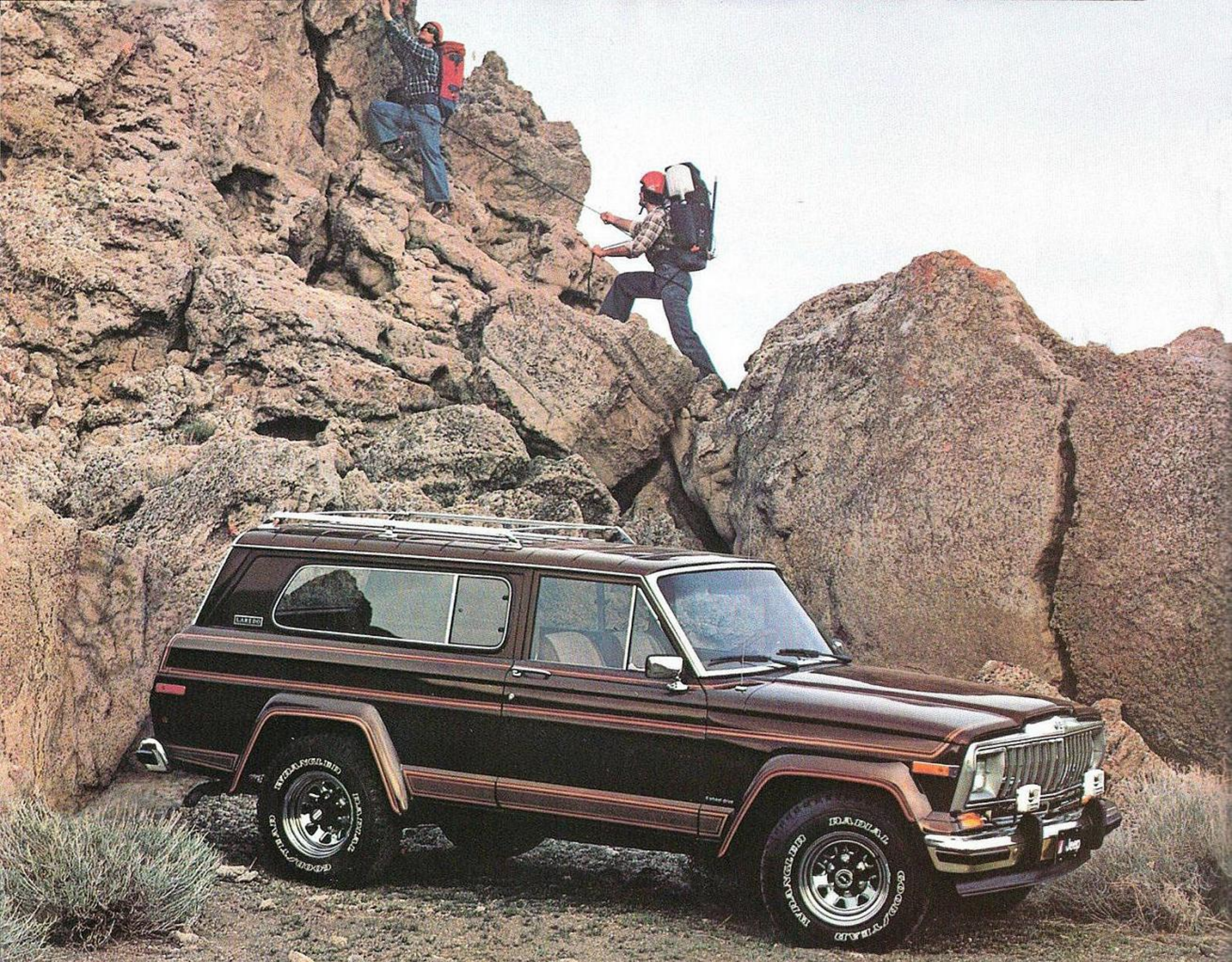
Cherokee Laredo 2-Door (above)