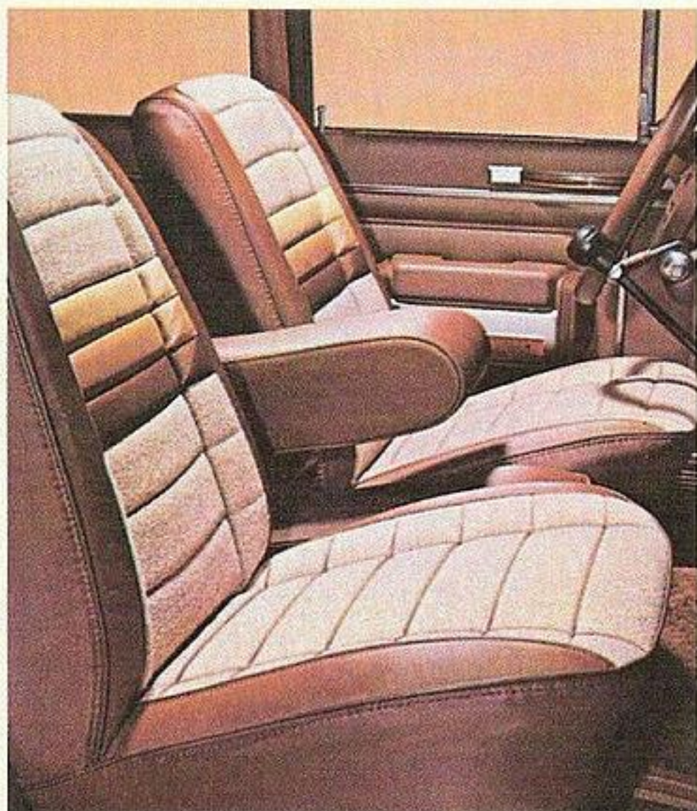
Western Weave Interior