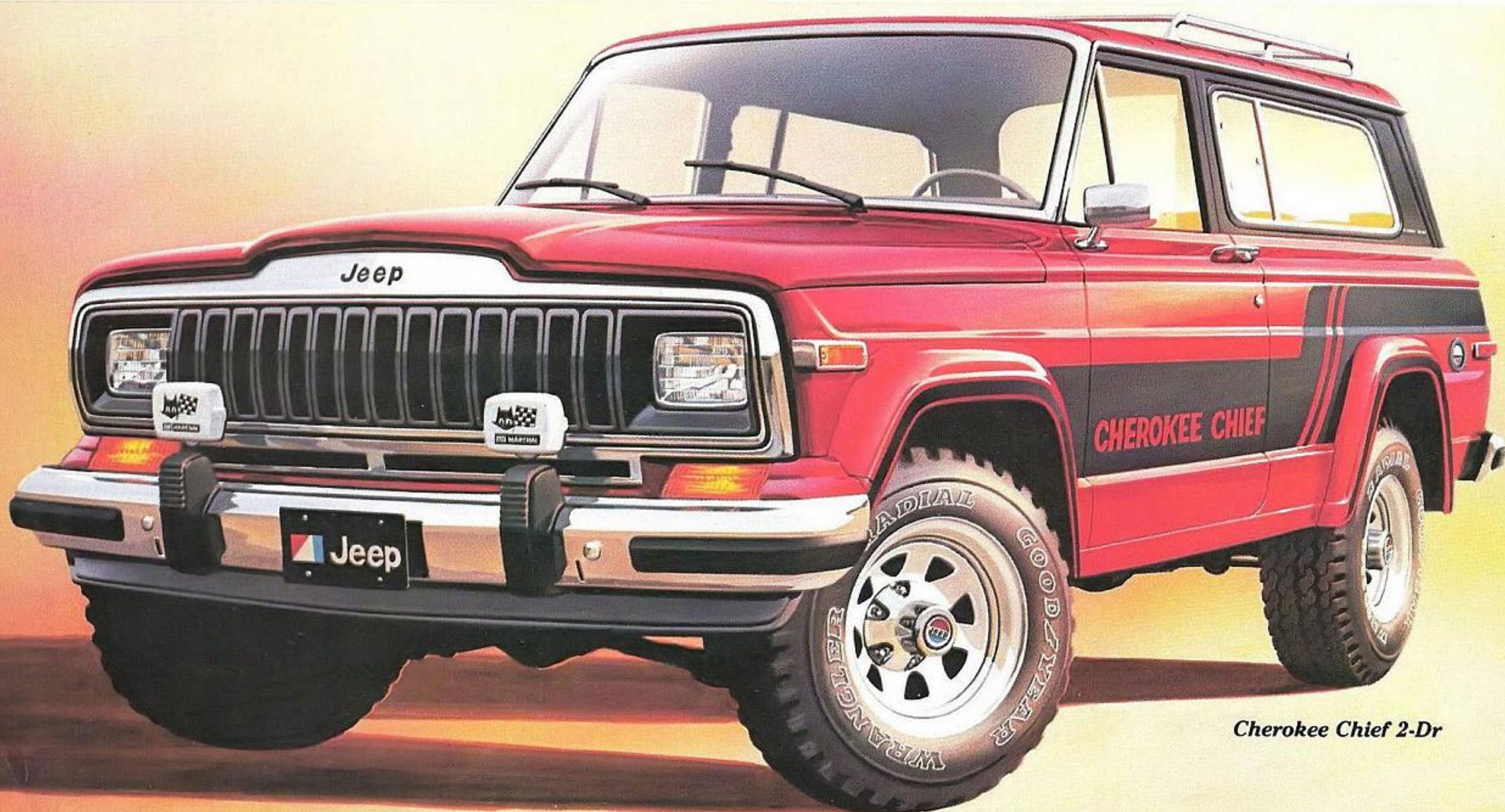
Cherokee Chief 2-Dr