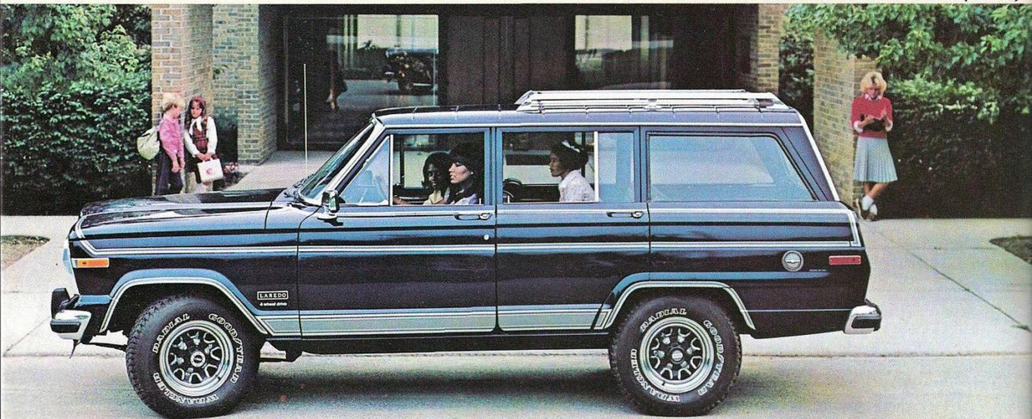
Cherokee Laredo 4-Door (below)