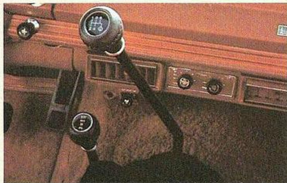
Part Time 4WD Transfer Case