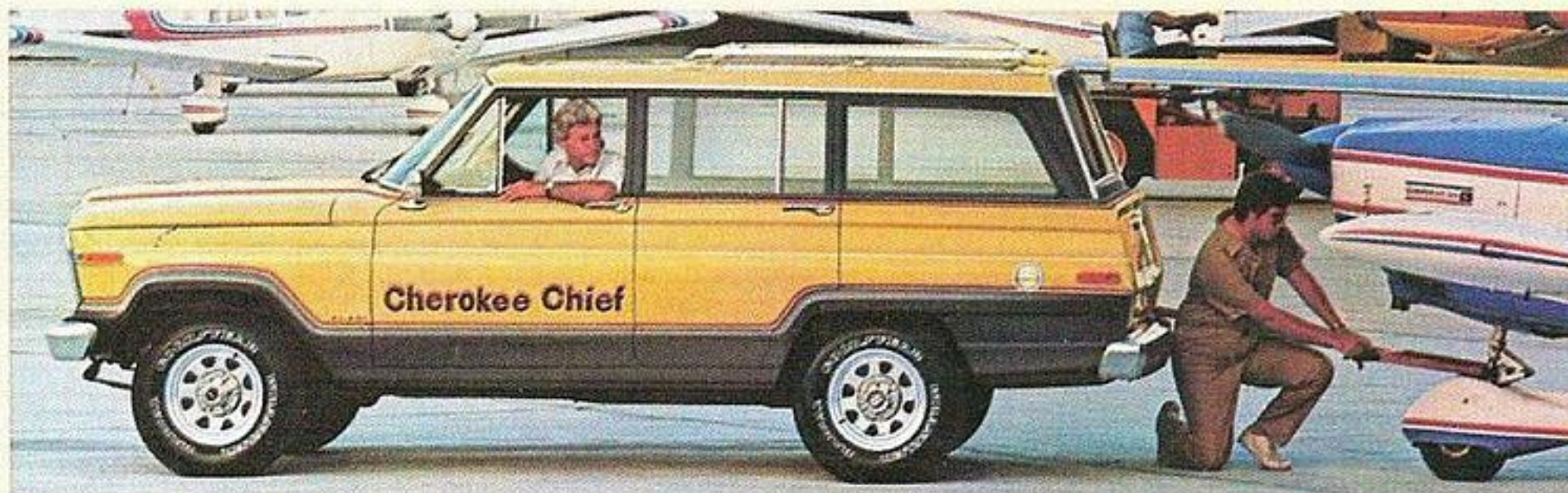
Cherokee Chief 4-Door

Tens of thousands of off-road enthusiasts who take their pastime seriously, take to Jeep Country in the magnificent Jeep Cherokee. It's first choice of so many because it offers so much.