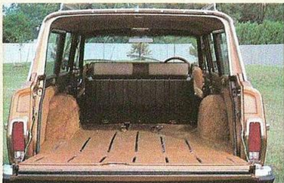
Folding and Removable Rear Seat