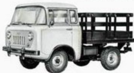
FC-150 STAKE MODEL

More muscle, more power, more payload—and still Forward Control, the FC-170 packs a big 3,510 lbs. payload in its 45 cu. ft. cargo box. On a wheelbase of 103½ in., the FC-170 turns in a 21 ft., 10 in. radius, and the driver can see the road ahead six ft. from the front bumper. Available as a pick-up truck, stake with single or dual rear wheels, or cab and chassis only, the FC-170 easily accommodates big loads, with balanced weight distribution.