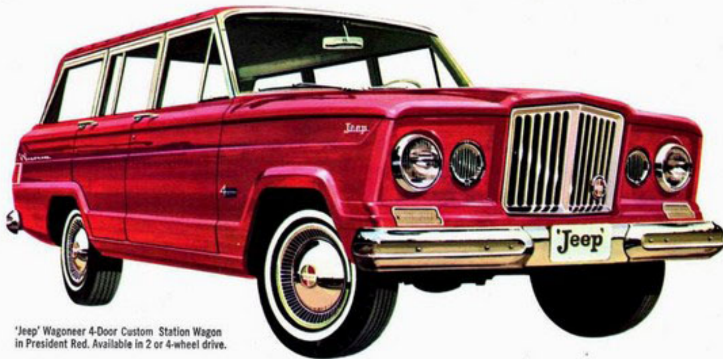
'Jeep' Wagoneer 4-Door Custom Station Wagon in President Red. Available in 2 or 4-wheel drive.

Whistle-clean—from underbody to instrument panel—that's the 'Jeep' Wagoneer. Here's classical design with traditional ruggedness, comfort and roadability . . . in your choice of 2 or 4-wheel drive, 2-door or 4-door models. You can go 30,000 miles between lube jobs . . . 6,000 miles between oil changes. And beneath that handsome exterior there's a frame of steel—protecting passengers, cargo, axles, drive shafts, and suspension. Automatic transmission available—a 'Jeep' vehicle "first" with 4-wheel drive.