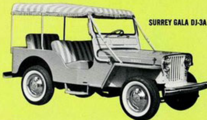
SURREY GALA DJ-3A

Colorful choice of smart shops, small businesses, resort motels and hotels throughout the world, the Surrey Gala with the fringe on top is economical to buy and operate. Washable curtains, tops and seat coverings made of sturdy weather-resistant fabrics. Three two-tone paint options.