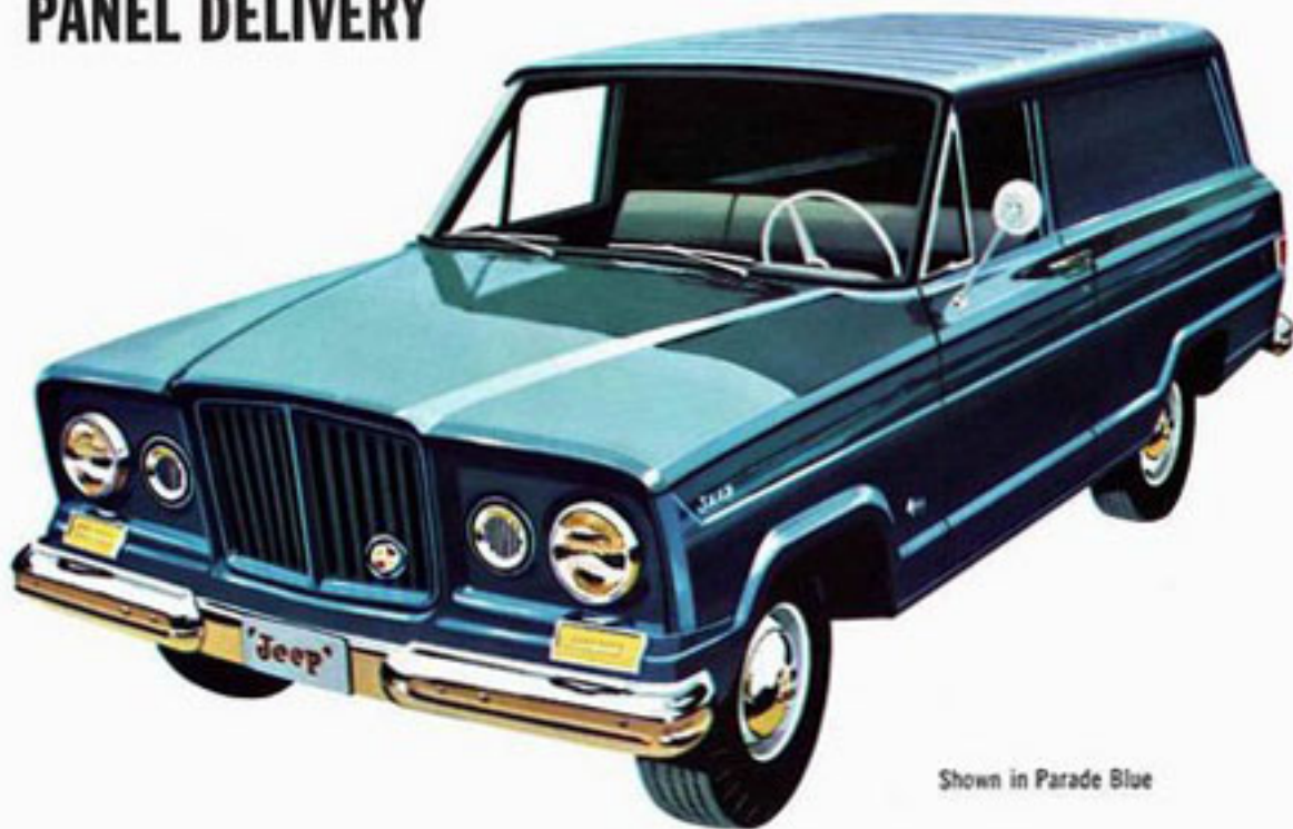
Shown in Parade Blue

INTERIOR: Easy-to-read instrument panel, standard compass (4WD model), and uncluttered floor space make the Panel Delivery safer and more convenient. Straight door posts eliminate "dog-leg." Wide 82-degree door swing takes the work out of entering and leaving.