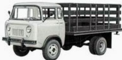
FC-170 DUAL WHEEL STAKE MODEL