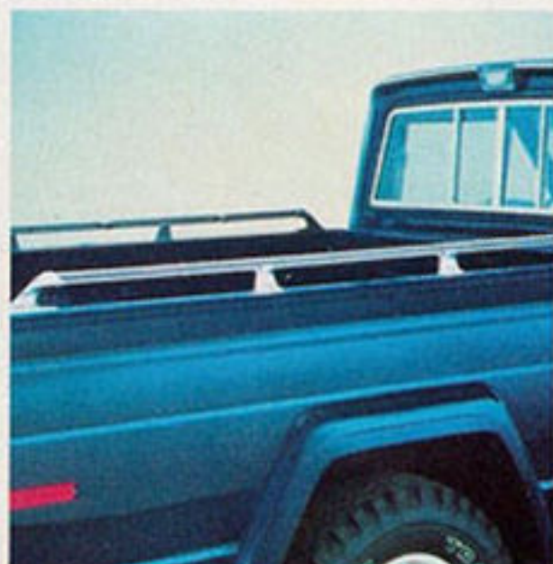
Truck rails (dealer installed)