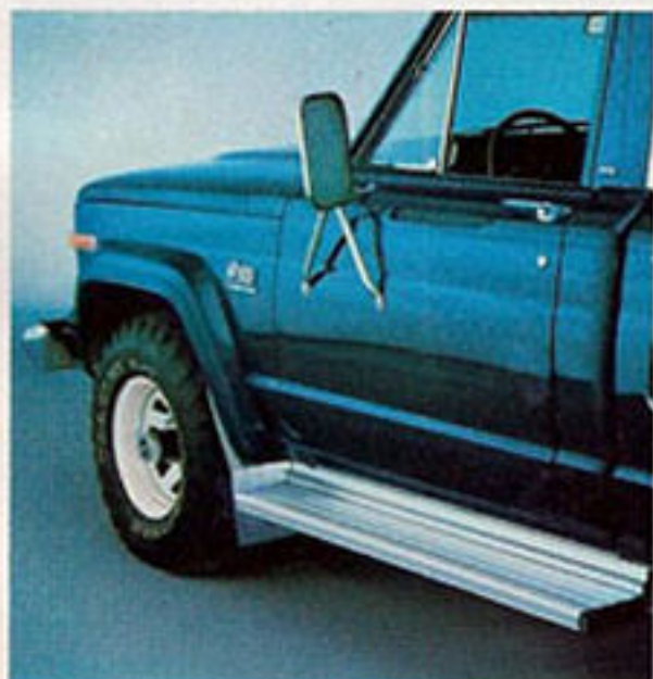
Running boards (dealer installed)