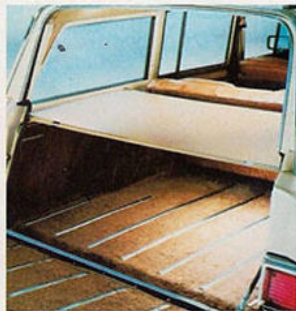
Cargo area cover (Std. on Limited)