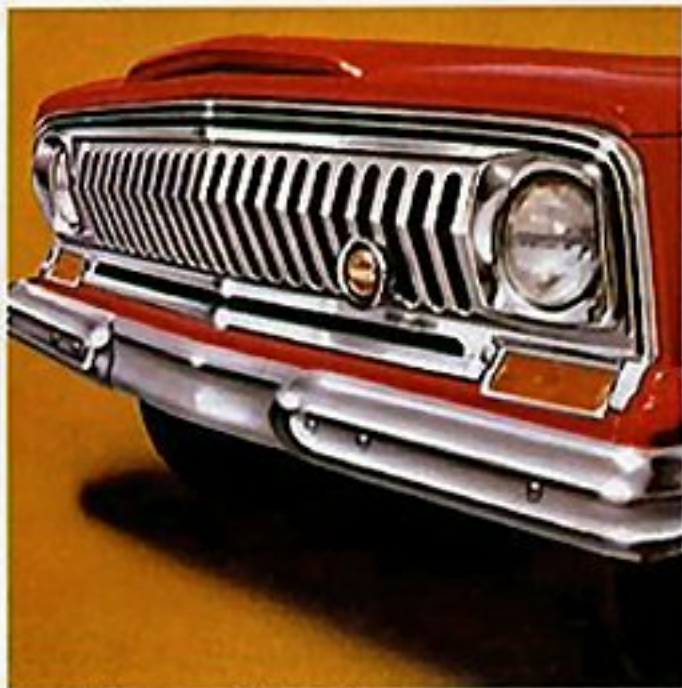
Classic Beauty . . . Built For Duty.