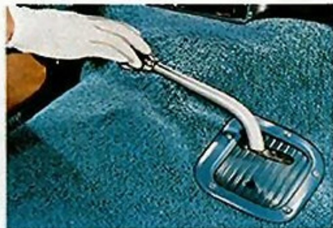
Dual Range Transfer Case.