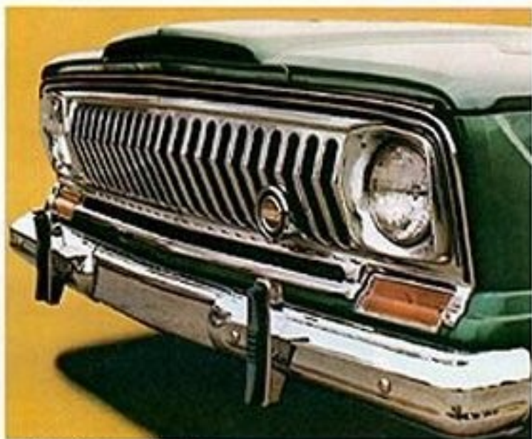
Front Bumper Guards