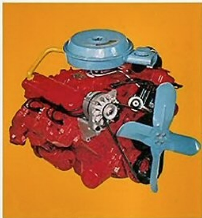
NEW Dauntless V-8 Engine.

‡Optional at no extra cost. *Standard on 4-door Wagoneer