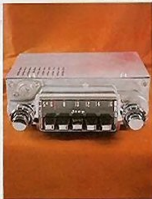
Transistor Push Button Radio