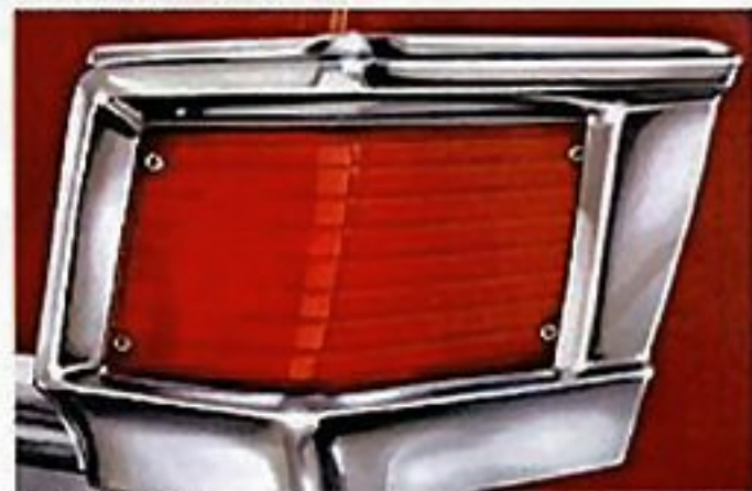
Tail Lamp Trim.