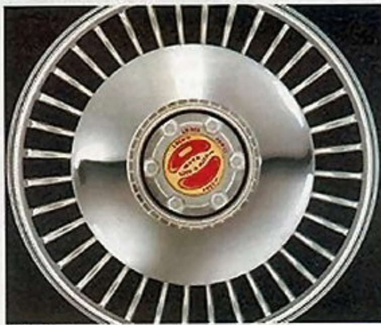
Selective Drive Hubs