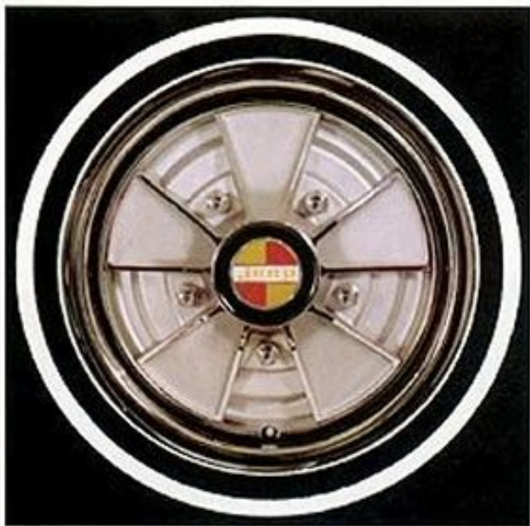
Mag-Type Wheel Covers