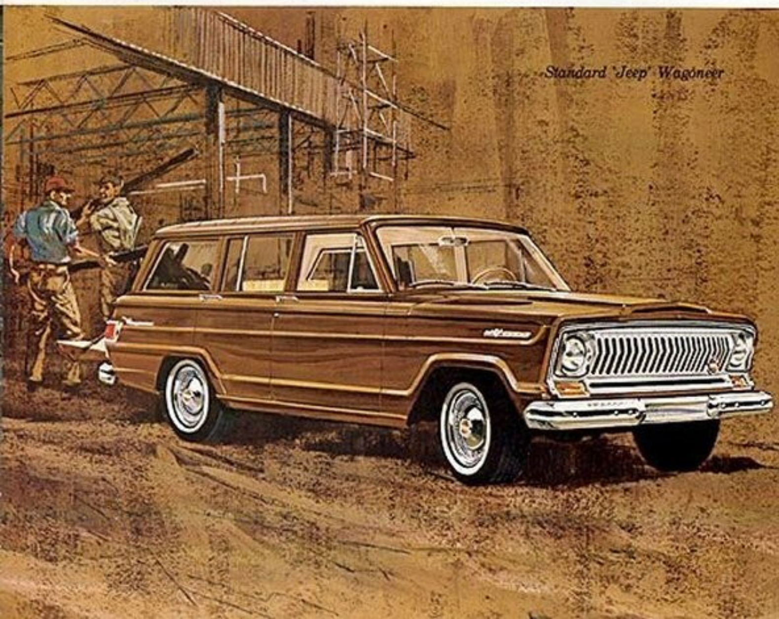
Standard 'Jeep' Wagoneer

Plush comfort and a luxury appearance are features of the 'Jeep' Wagoneer . . . 4-wheel drive is the bonus. With twice the traction of ordinary wagons, the 4-wheel drive 'Jeep' Wagoneer travels hairpin curves, slippery roads and muddy trails . . . places 2-wheel drive cars slip, slide and bog down. And 4-wheel drive has never been easier to operate than in the Wagoneer: Just pull the "power bolt" — at any speed — and you're in 4-wheel drive, ready for the rough stuff. It's that simple! With the proper equipment, the 4-wheel drive 'Jeep' Wagoneer can plow snow, winch boats out of water, pull 5,000 pound travel trailers, and do a multitude of extra-duty tasks. It all adds up to traditional 'Jeep' usefulness plus the appearance and comfort of a luxury wagon!