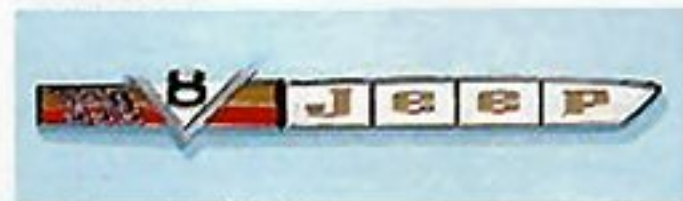
NEW Dauntless V-8 Engine.