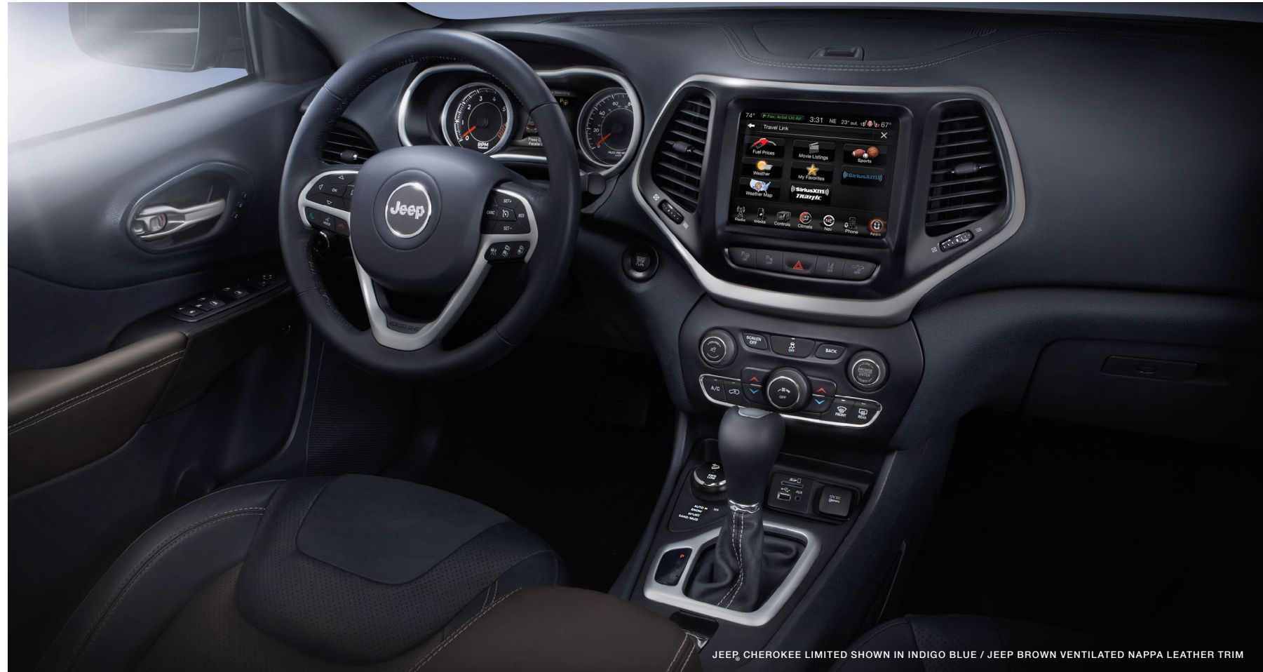
JEEP, CHEROKEE LIMITED SHOWN IN INDIGO BLUE / JEEP BROWN VENTILATED NAPPA LEATHER TRIM

PREMIUM FEATURES AND DESIGNER PALETTES. Every sculpted inch of the all-new Cherokee has been thoughtfully designed to offer versatile convenience and absolute beauty. Five interior color palettes offer choices inspired by exotic world locations, from Morocco to the Grand Canyon to Mt. Vesuvius. Luxurious Nappa leather trim is available on optional power-adjustable, heated and ventilated seats, with hide-away storage for laptops and such available beneath the fold-flat front-passenger seat. Soft-touch materials are featured on nearly every surface within reach. Convenient storage within the instrument panel, plus other cubby bins, offers plenty of places to keep important items neatly out of sight, including an integrated phone docking station and available wireless charging pad. The 60/40 split-folding second-row seats adjust fore and aft, and can recline six degrees, adapting to leg- and cargo-room needs. And a new Jeep® Cargo Management System offers unique options for customization, so you can make the most of Cherokee's roomy interior.