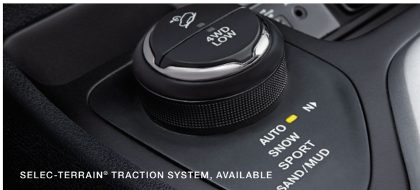
SELEC-TERRAIN® TRACTION SYSTEM, AVAILABLE

BORN OF AUTHENTIC JEEP® BRAND DNA. The all-new 2014 Jeep® Cherokee raises the bar, offering best-in-class 4x4 capability 1 for those who require the distinct advantages of an all-weather warrior. Choose from three new 4WD systems: the single-speed, fully automatic Jeep Active Drive I, and the two-speed Jeep Active Drive II with torque management and low range, and Jeep Active Drive Lock with locking rear axle. An automatically disconnecting rear 4WD axle increases efficiency while providing superior 4x4 performance. The available Trailhawk model hands over authentic Trail Rated® capability, plus one inch of increased ground clearance, with a boulder-pounding crawl ratio of 56:1 when powered by the new 2.4L TigerShark MultiAir® I-4 engine.