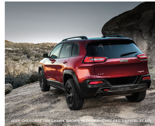
JEEP® CHEROKEE TRAILHAWK SHOWN IN DEEP CHERRY RED CRYSTAL PEARL