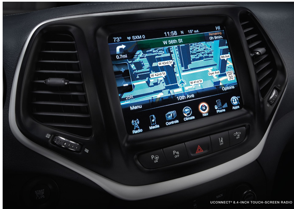
UCONNECT® 8.4-INCH TOUCH-SCREEN RADIO