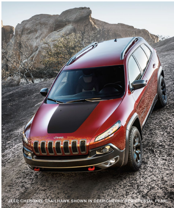
JEEP CHEROKEE TRAILHAWK SHOWN IN DEEP CHERRY RED CRYSTAL PEARL