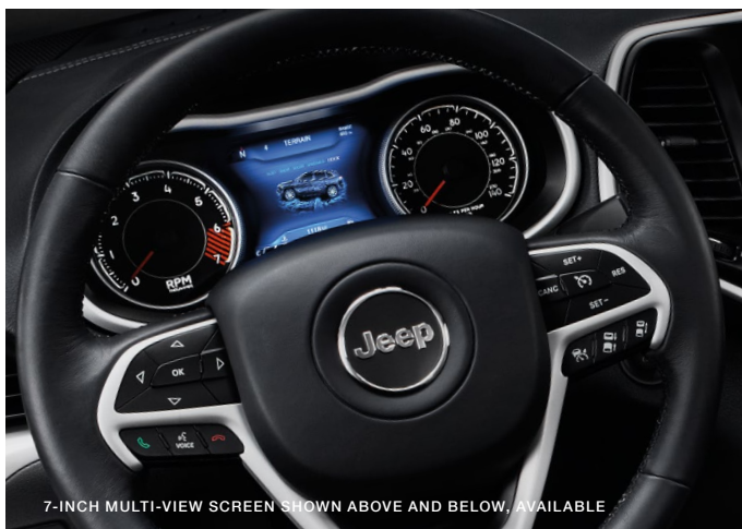
7-INCH MULTI-VIEW SCREEN SHOWN ABOVE AND BELOW, AVAILABLE