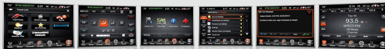
UCONNECT® 8.4-INCH COLOR TOUCH SCREENS

* Check uconnectphone.com for compatibility. **Service-enabled vehicle must be located in U.S. or Canada.