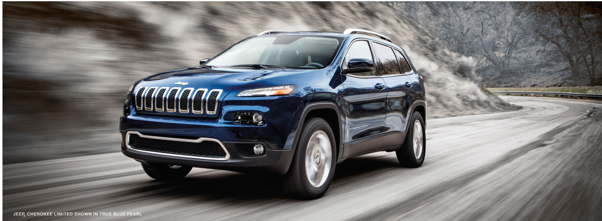
JEEP® CHEROKEE LIMITED SHOWN IN TRUE BLUE PEARL