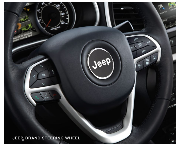
JEEP® BRAND STEERING WHEEL

* Chrysler estimated highway mpg. Final EPA mileage not available at time of publication. Use for comparison purposes only.