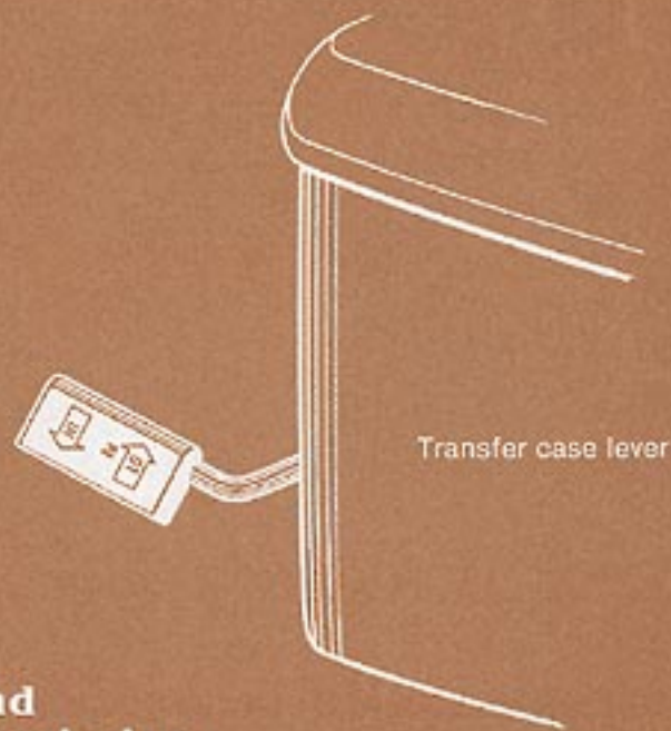
Transfer case lever

2.6 to 1 ratio gives you maximum push-pull in 4-wheel drive. A high range for normal 4WD situations.