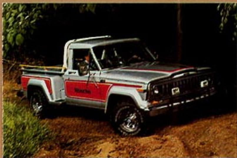
Switch to Low Range for tough spots.