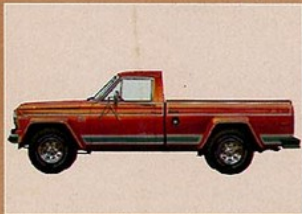
Jeep J-10 Pickup.