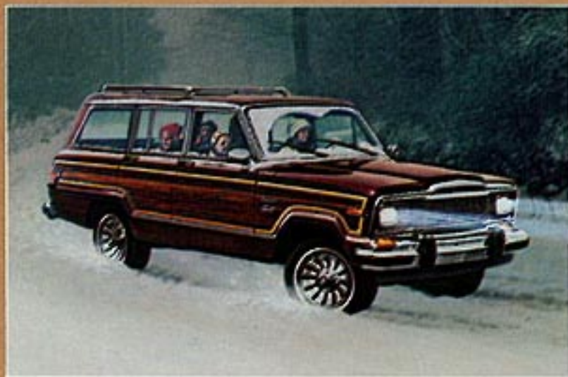
Stay in full-time 4-wheel drive anywhere.

any kind of road surface. Travel on dry pavement at sustained highway speeds in quiet comfort. Even stay in 4-wheel drive for the entire season. All with no damage to or excessive wear of the powertrain or tires. Try it yourself with a test drive!